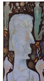
Bill Brewer A Blind Knowing , 1993