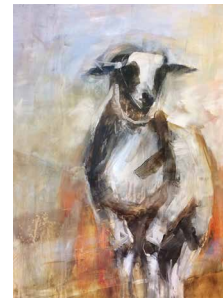
Bethany Rowland Without Judgment , 2014