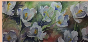
Beverly Jozwiak Early Morning Crocus