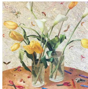
Katherine Ace Conversation , 2007