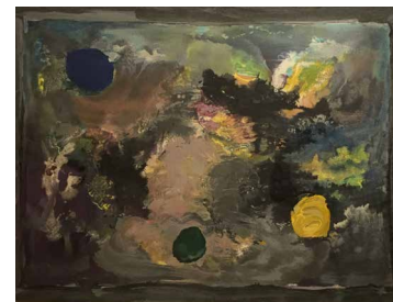
Jules Olitski Elegy, 2002