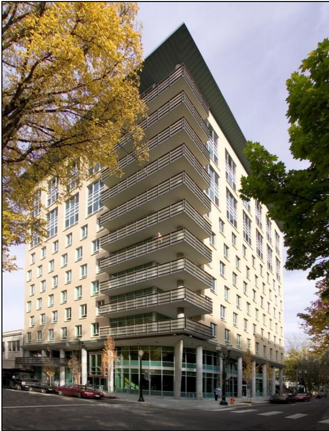
New Construction 2004 – Harris Building