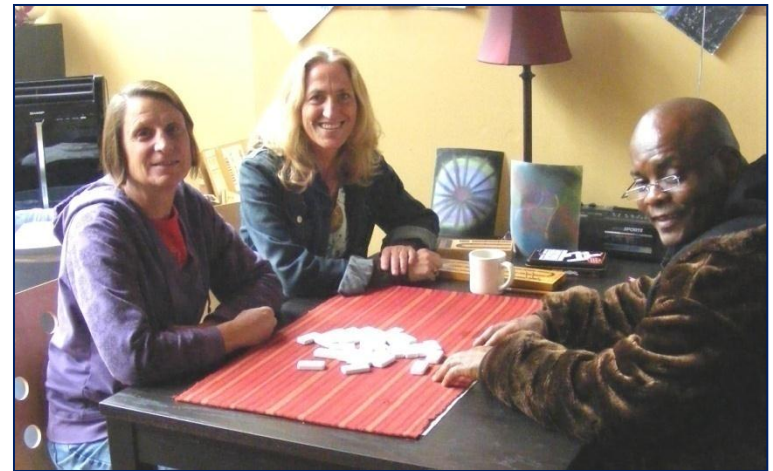
CEP Community Room